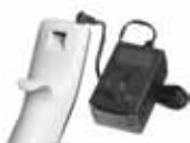
Part No. 2910012 eVol® Universal Charger